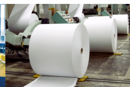
Pulp & Paper