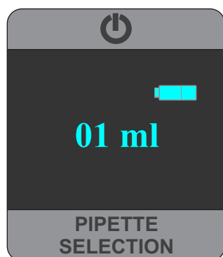
OLED SCREEN VIEW

Large easy-to-read monochrome display screen adds a layer of protection against accidental impacts, scratches and chemical spills.