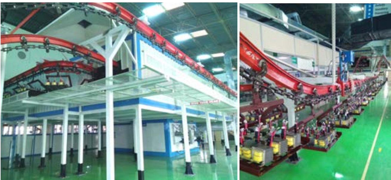
AUTO VARNISHING COATING OVEN