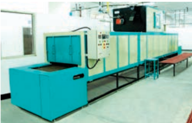
Belt Converyorised Curing Oven