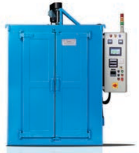
Batch Type Electrical Oven