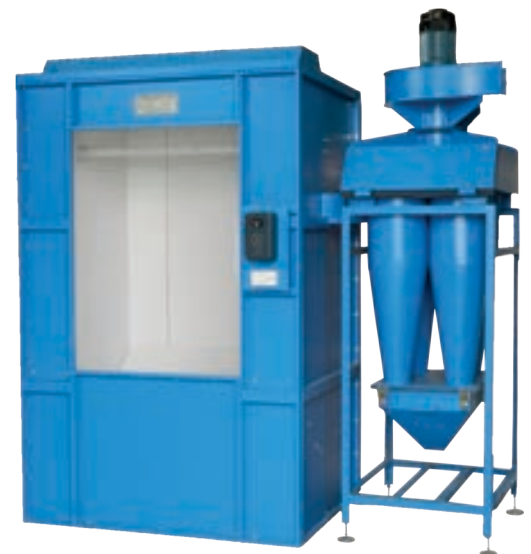
Multi Cyclone Coating Booth