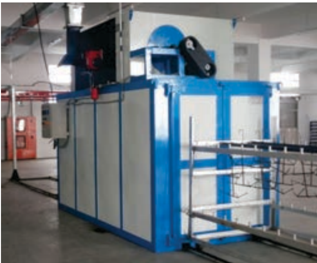
Oil/gas Fired Batch Type Curing Oven