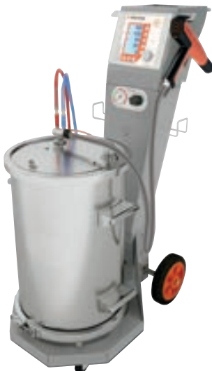
Powder Coating Gun