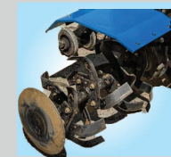
Optimum rotavator blade for efficient weeding & longer life