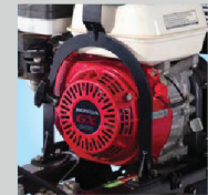
Fuel efficient Engine & Reliable