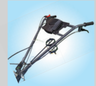
Adjustable and Rotatable Handle Bar