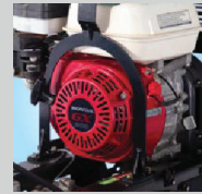
Fuel efficient Engine & Reliable