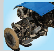
Optimum rotavator blade for efficient weeding & longer life