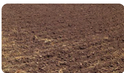
SEED BED PREPARATION