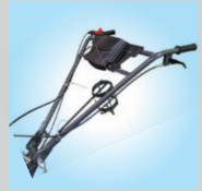
Adjustable and Rotatable Handle Bar