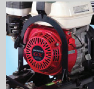
Fuel efficient Engine & Reliable