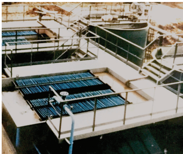
Installation in India of 2 x 100% Lamella Clarifiers with flocculation tanks. Each clarifier is rated for a maximum flow of 240 m 3 /h

Laboratory & pilot plant capabilities and trained technical experts ensure the optimum size of INDION Lamella Clarifier to suit your requirements.