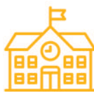
Schools & Colleges