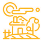
Villas & Residential owners