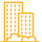
Constructions & Real estates