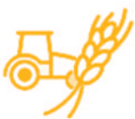
Agriculture & Farming