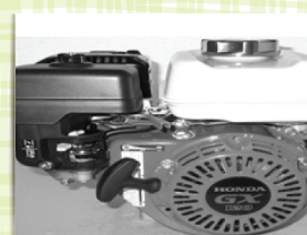
Honda GX Engine