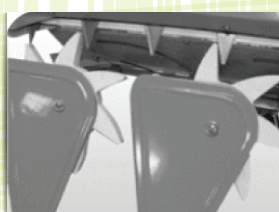
Reaping Section Reaping Head