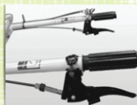
Main Clutch & Harvesting Clutch