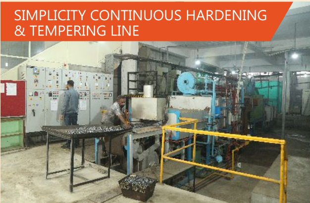
SIMPLICITY CONTINUOUS HARDENING & TEMPERING LINE