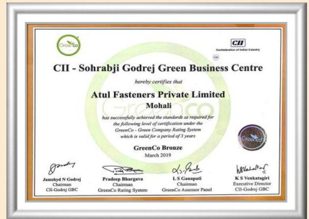
Green Business Centre