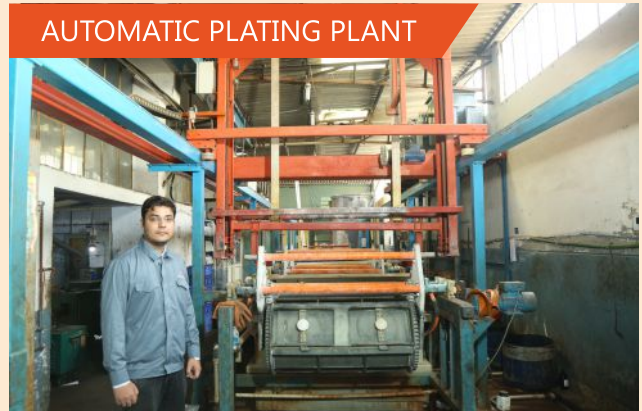
AUTOMATIC PLATING PLANT