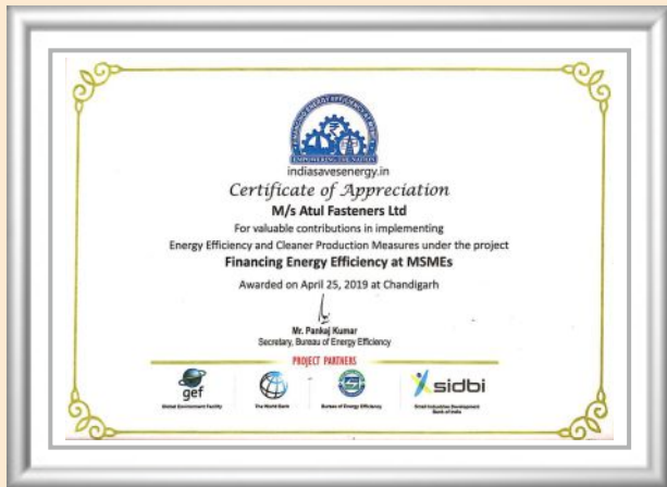
Energy Efficiency & Cleaner Production