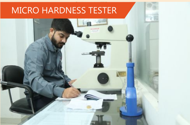
MICRO HARDNESS TESTER